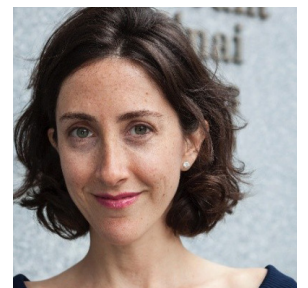
The New York Times opinion column, June 17, 2023

“What would Taylor Swift do?” is a refrain among certain patients in my practice. Teenagers suffer for many reasons. One is being fragile and in formation — a human construction site. Another is being surrounded by others who are fragile and in formation. Ms. Swift articulates not only the treachery of bullying but also the cruelty just shy of it that is even more pervasive: meanness, exclusion, intermittent ghosting. She says: Borrow my strength; embrace your pain; make something beautiful with it — and then you can shake it off.”